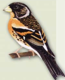
• Vietnamese Greenfinch Carduelis monguilloti (Se Thong Dau Den) – Dalat Plateau