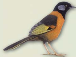
• Collared Laughingthrush Garrulax yersini (Khuou Dau Den Ma Xam) – Dalat Plateau