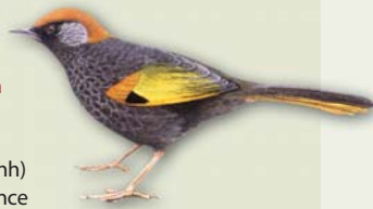
• Chestnut-eared Laughingthrush Garrulax konkakhensis (Khuou Tai Hung) – Mount Ngoc Linh