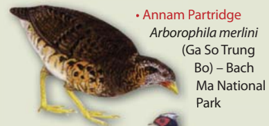
• Annam Partridge Arborophila merlini (Ga So Trung Bo) – Bach Ma National Park