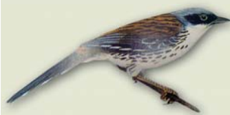
• Grey-crowned Crocias Crocias langbianis (Mi Langbian) – Dalat Plateau