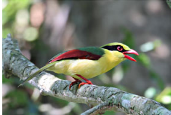
Indochinese Green Magpie

An early morning visit to Deo Suoi Lanh to look for other exciting possibilities that could include Blue or Rusty-naped Pittas, Indochinese Green Magpie, Spotted Forktail or Green Cochoa, before continuing along Highway 20 to the cooler climes of Dalat. In the afternoon make the first of several visits to the Ta Nung Valley, a small but bird-filled area of remnant evergreen forest 10 km from Dalat. This is the most accessible site for the rare and endemic Grey-crowned Crocias and Orange-breasted Laughingthrush. In addition the very distinct local subspecies of Blue-winged Siva, Black-headed Sibia and Black-throated Sunbird are common here. Overnight at Dalat.